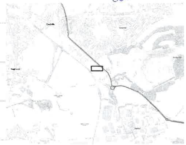
LOCATION PLAN @ 1:2500